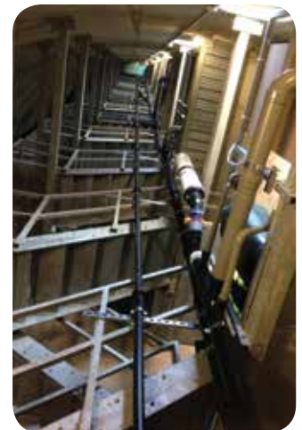
P.A.P.A. system testing at the National Lift Tower